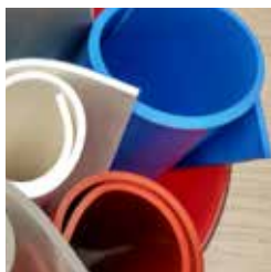
Rubber sheeting and matting