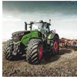
Trelleborg Wheel Systems