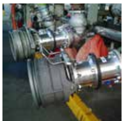
Oil and gas flow control