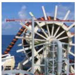
Offshore oil and gas transfer