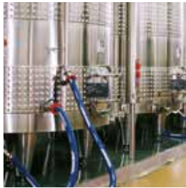
Trelleborg Industrial Solutions

Trelleborg is a world leader in engineered polymer solutions that seal, damp and protect critical applications in demanding environments. Its innovative solutions accelerate performance for customers in a sustainable way. The Trelleborg Group has annual sales of about SEK 37 billion (EUR 3.46 billion, USD 3.87 billion) in about 50 countries. The Group comprises three business areas: Trelleborg Industrial Solutions, Trelleborg Sealing Solutions and Trelleborg Wheel Systems, and a reporting segment, Businesses Under Development. The Trelleborg share has been listed on the Stock Exchange since 1964 and is listed on Nasdaq Stockholm, Large Cap. www.trelleborg.com