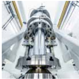
Trelleborg Sealing Solutions