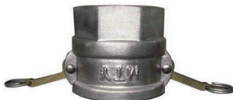
D type coupling