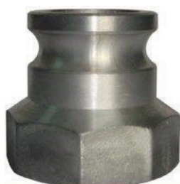
G type coupling