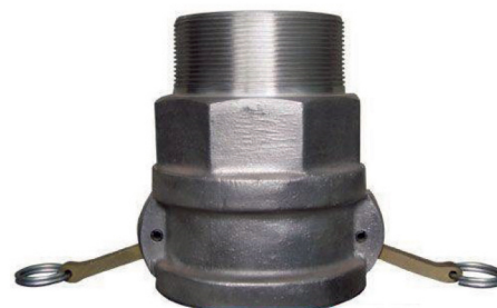
H type coupling