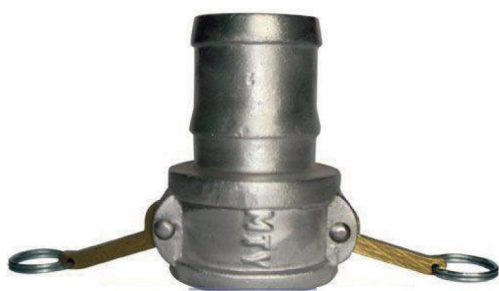
A type coupling