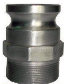
B type coupling