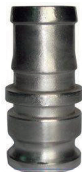
E type coupling