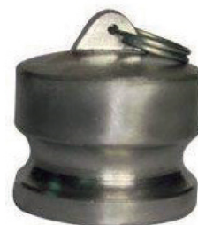
F type coupling