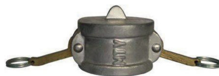
C type coupling